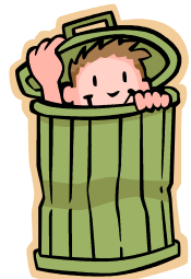
Keep trash cans covered