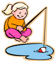
Stock small ponds with fish