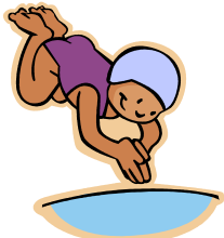
Empty wading pools