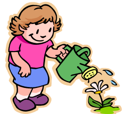
Empty watering cans and flower pot dishes