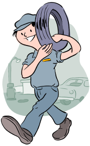
Dispose of old tires