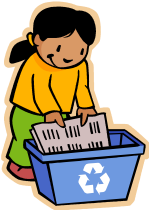
Recycle cans and bottles

Don't give mosquitoes a chance! Wherever water collects, mosquitoes can grow.