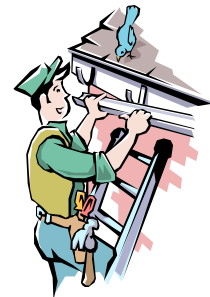
Clean roof gutters