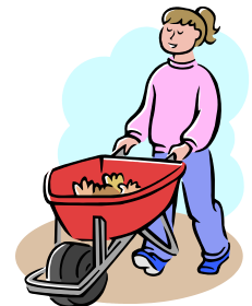
Turn wheel barrows over and store toys inside

Mosquitoes need water to grow. It doesn't take much water. It doesn't take much time. Many places around your home may be creating your mosquito problem. Dump or drain any standing water — Check buckets, jet skis and boats, toys, and tarps, Clean and refresh birdbaths and screen off rain barrels.